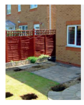
Install the concrete pads as per the pad plan supplied. Note the lack of mess and disruption.