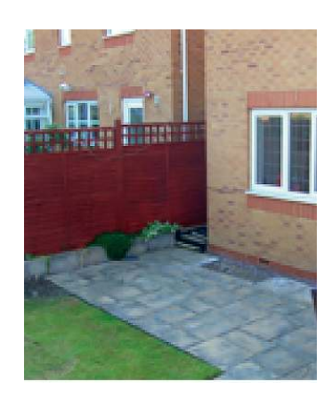
Durabase can be sited anywhere, even on a sloping site.

This is a steel foundation system, consisting of an outer ring beam and internal steel joists, made out of quality British steel, fabricated by our engineers to millimetre precision to meet your specification.