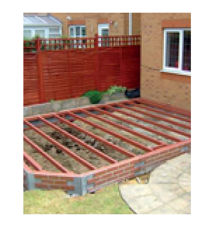
Attach the steel to the house wall, build and level the base using the adjustable legs.